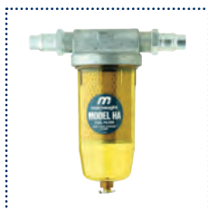
HA-01: Fuel filter kit