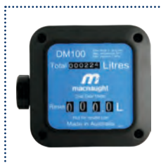
DM100-01: Mechanical fuel meter